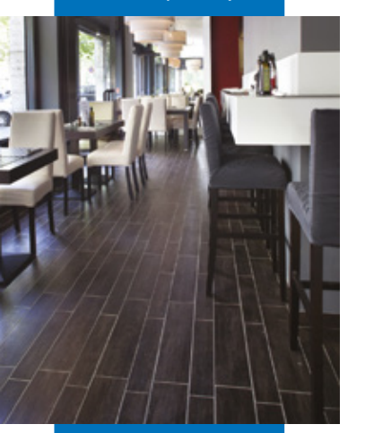
Alcuino Bar -Milan - Italy

an overall cure of at least 28 days unless they have been made with the special MAPEI binders for screeds such as Mapecem or Topcem or with ready-mixed mortars such as Mapecem Pronto or Topcem Pronto .