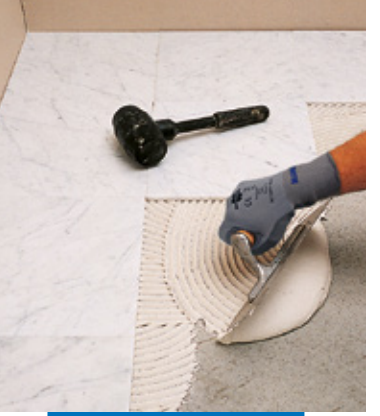
Setting white Carrara marble with Keraquick S1 white