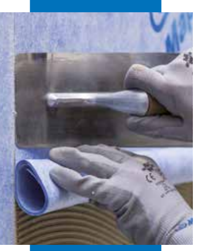
Application of the second sheet