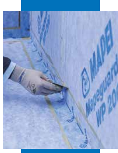
Application of Mapeguard ST

All relevant references for the product are available upon request and from www.mapei.com